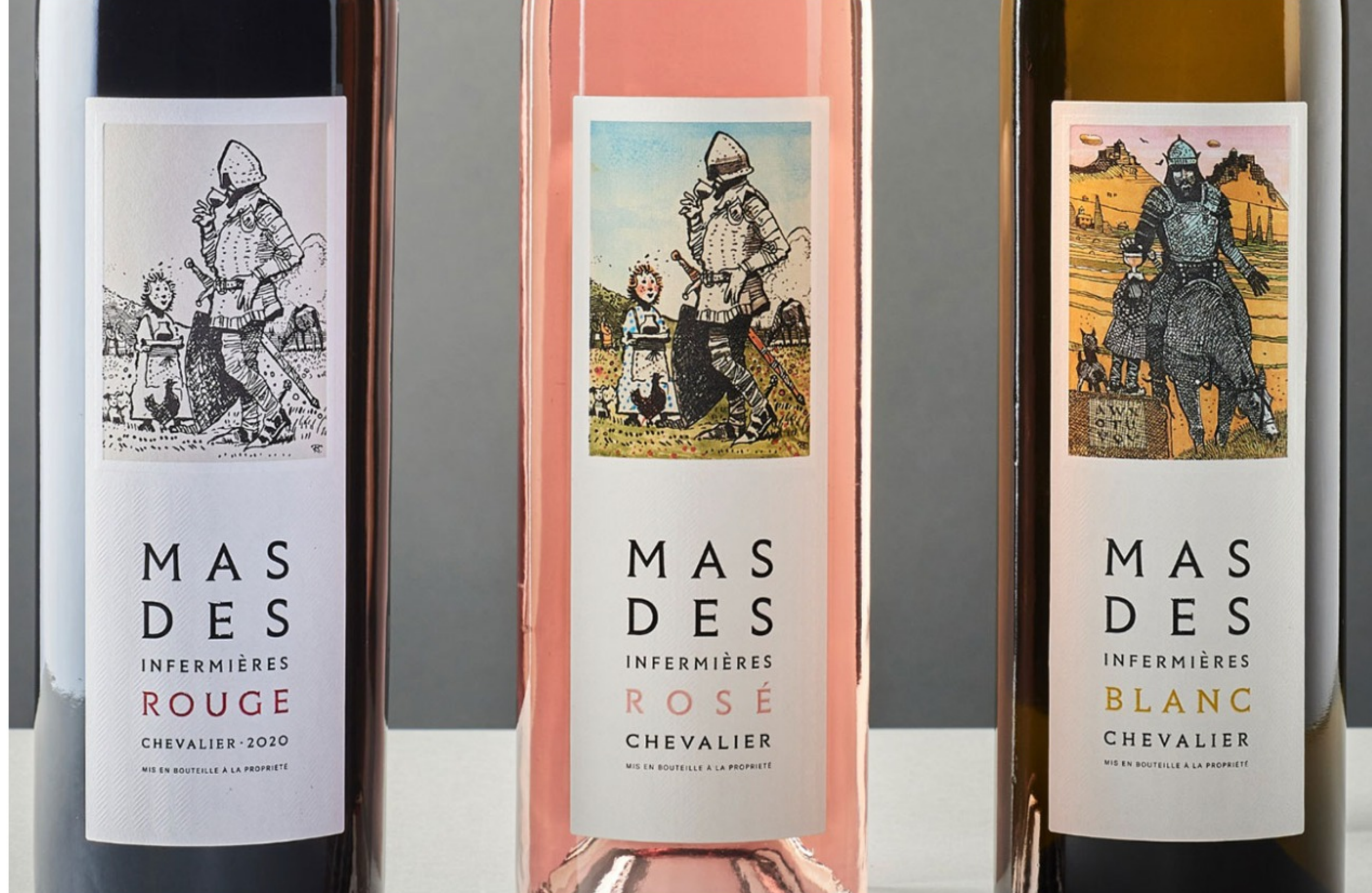
Labels in the Chevalier collection.

Ridley Scott himself sketched artwork for the wines' labels, added the estate, which lies close to ancient citadel Oppède-le-Vieux in northern Luberon . The Luberon appellation sits at the south-eastern tip of the Rhône Valley wine region.