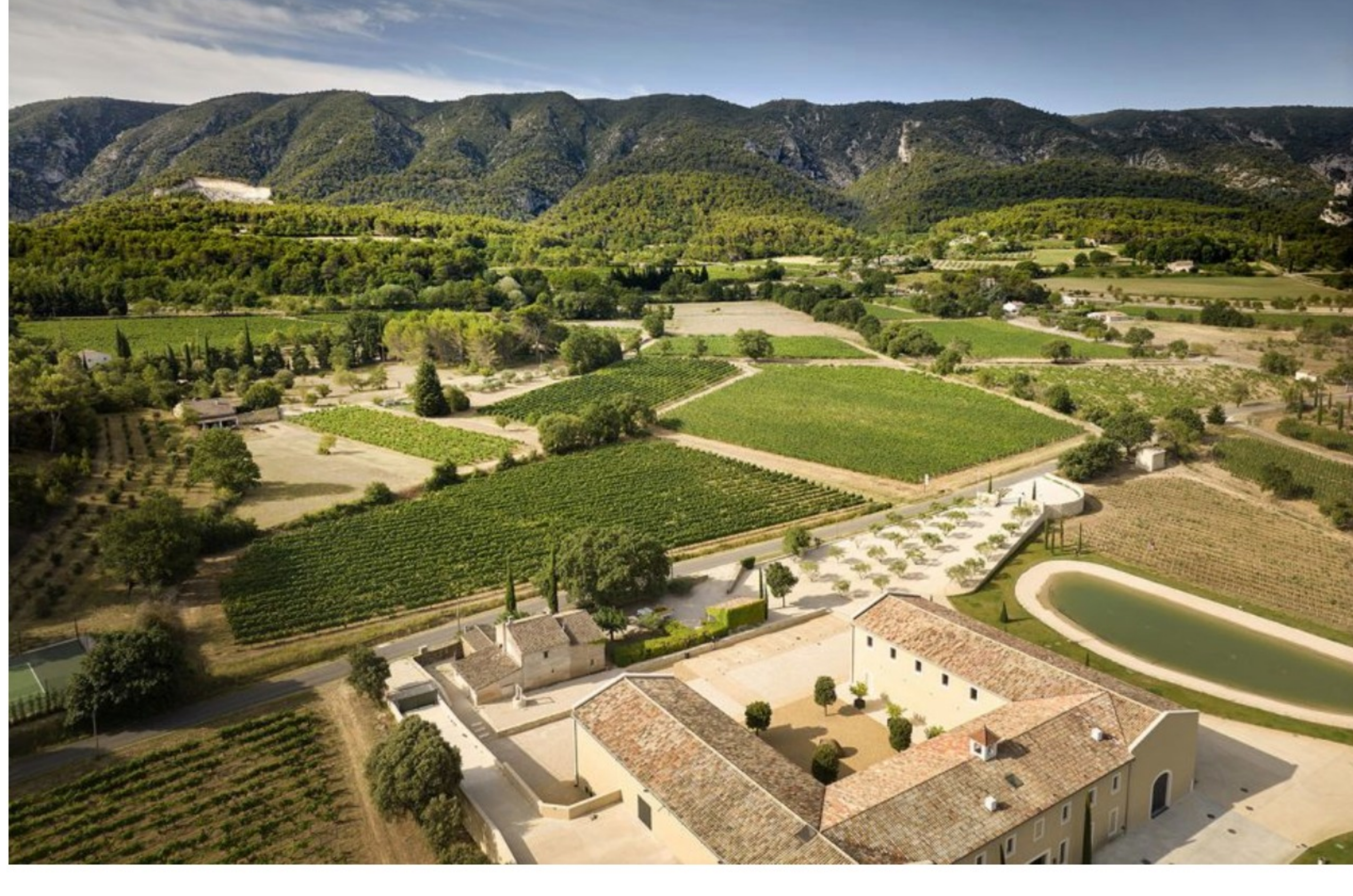
Mas des Infermières from above.