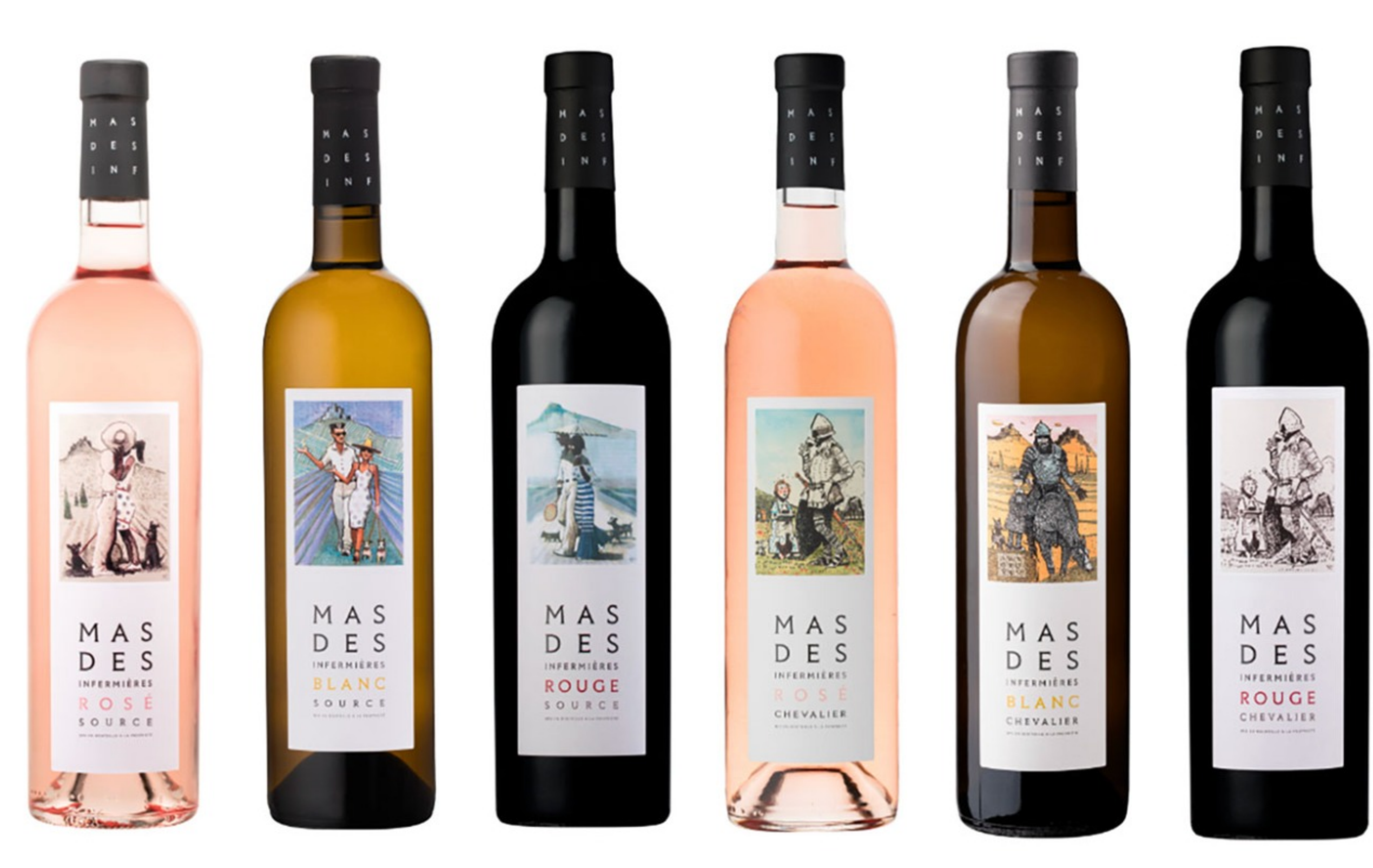
The Source and Chevalier wine collections.